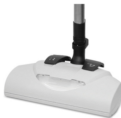
Electric broom, wand and hose